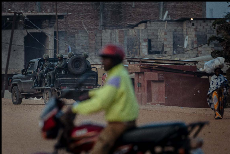
The M23 armed group patrols Uvira, Democratic Republic of Congo, December 13, 2025.

Under international law, Rwanda’s overall control of the M23 armed group and effective control over areas of North and South Kivu provinces, including Uvira, made Rwanda an occupying power. The systematic nature of many of the abuses points to the involvement of M23 commanders and Rwandan military officials, and their possible legal liability for war crimes. Human Rights Watch calls on the Rwandan and Congolese governments and regional and international courts to investigate these abuses and hold those responsible to account, including as a matter of command responsibility.