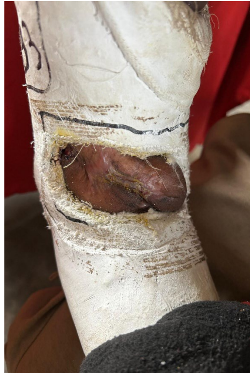
The wounds to the elbow of a man who was shot by M23 fighters in the Kasenga neighborhood of Uvira on December 10, 2025, while trying to flee the city.

The FARDC [Congolese army] had already left [the city], we were on our own and the Rwandans and M23 were killing people that were fleeing to Burundi.... We arrived at the port of Kavimvira but there was a lot of shooting. We made it to the roundabout [on the main road], but from there it was not clear what to do. We argued about which way to go, toward the lake or on the road. Suddenly, the M23 saw our group and shot at us. It was chaos. We had small bags that we threw off and we ran. I wasn't hit so I just ran to the lake. I saw my brother, his wife, and two of his children fall. 35