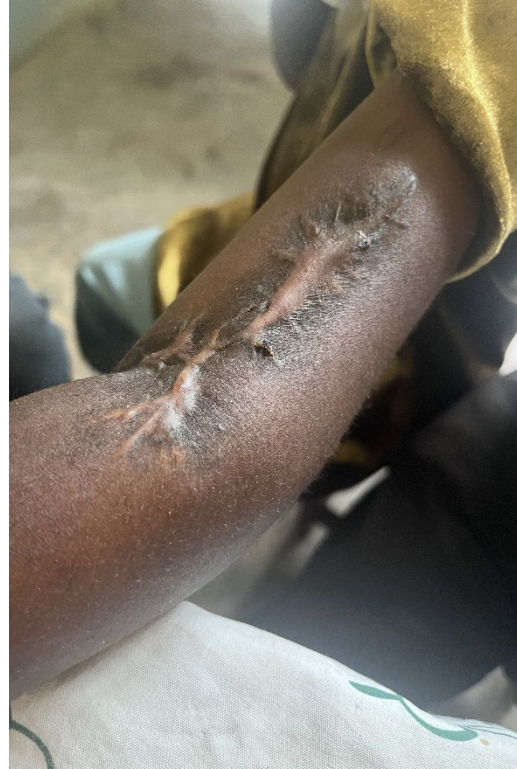
The scar of a 12-year-old boy who was shot in the arm by M23 fighters at his home in the Kasenga neighborhood of Uvira on December 10, 2025. The boy was also stabbed in the leg with a bayonet.

Once inside, they asked how many people were in the house and whether her husband was a member of the Wazalendo. She said that he wasn't, but they still took him and his two brothers, whom they grabbed from a separate house. 48 They forced them to sit and shot two of them, including the woman's husband, in the head. 49 They shot the third man in his side and wrist, and he survived. 50 "They just sat us down and shot us one after the