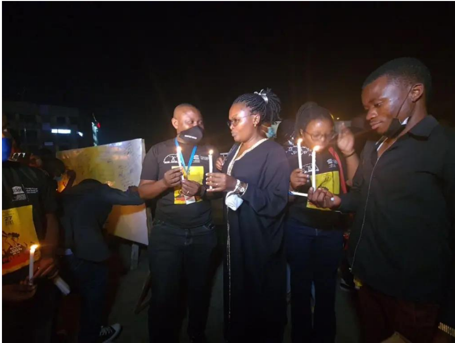
A Candle for Press Freedom campaign launched by media trade union in North Kivu to show solidarity with killed journalists and demand justice.