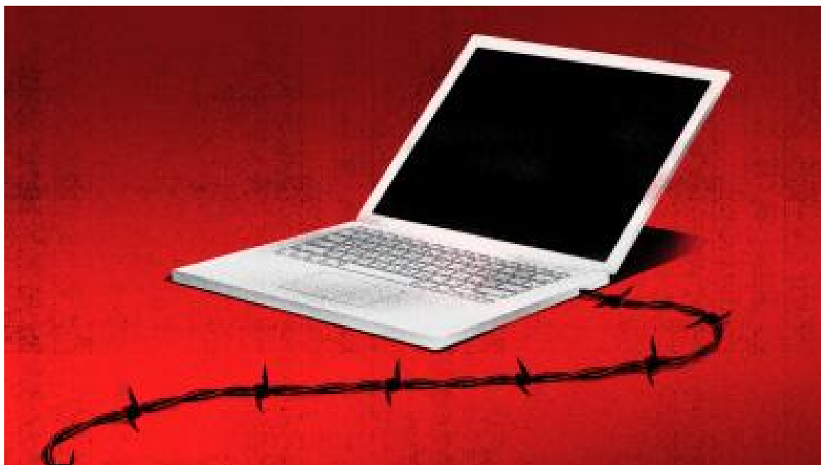
Shutting Down the Internet to Shut Up Critics