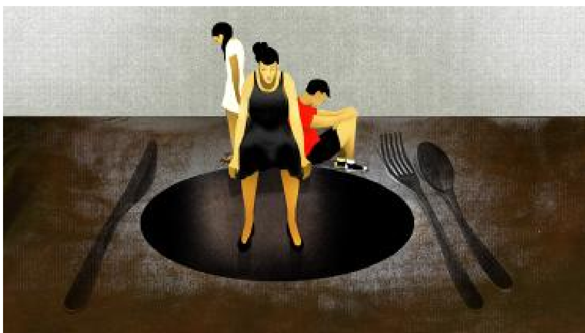
Going to the Bank for Food, Not Money: The Growing Reality of Hunger in “Rich” Countries