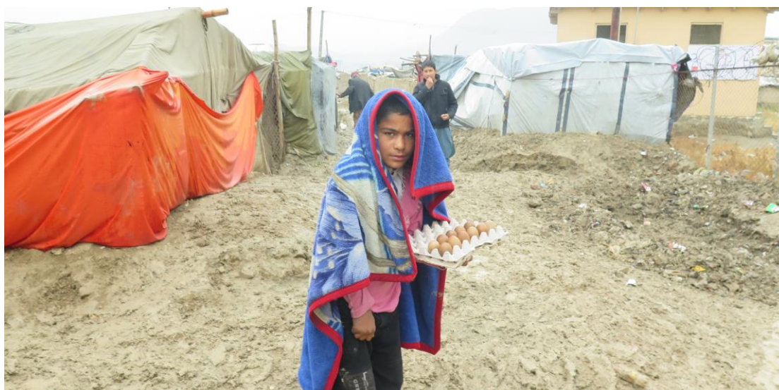
A 15-year-old boy in Kabul selling eggs at the local market to make a living. November 2015

building townships and roads, which is the mandate of other ministries. According to MoF officials, the MoRR failed to submit credible proposals for meeting the needs of displaced people in the 2016 budget because of “low capacity” and because “there is no mention of IDPs in [the MoRR’s] budget request”. 95