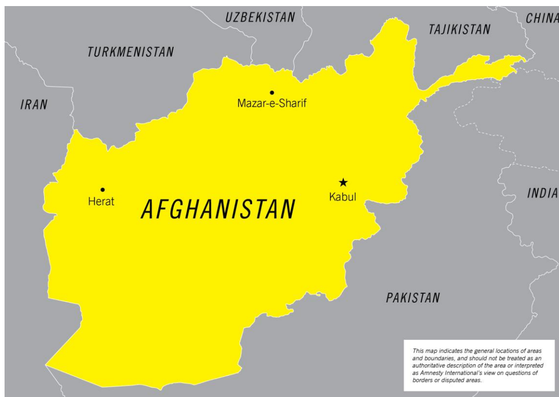
Map of Afghanistan, with the Herat, Kabul and Mazar-e-Sharif marked – the towns visited by Amnesty International for this report.