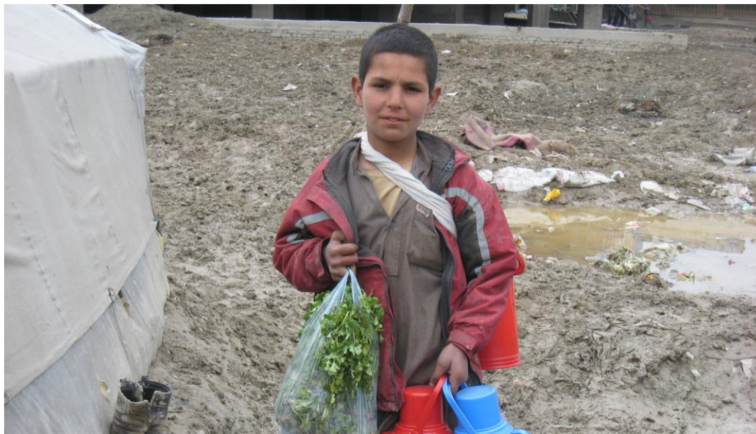
A 14-year-old boy in Charrahi Qambar settlement in Kabul, November 2015

Additionally, public hospitals only provide vaccinations and contraceptives free of charge, while other medicines must be bought from private clinics or pharmacies. While affording medicines is a struggle for many Afghans, it can be particularly difficult for displaced people who lack regular incomes and are often economically worse off than other urban poor (see more in section 4.5: Employment). Some displaced people reported having debts of several thousand Afs at private hospitals or pharmacies to buy medicines which they could not afford to pay back. One 55-year-old man in Naderabad camp in Mazar-e-Sharif said: