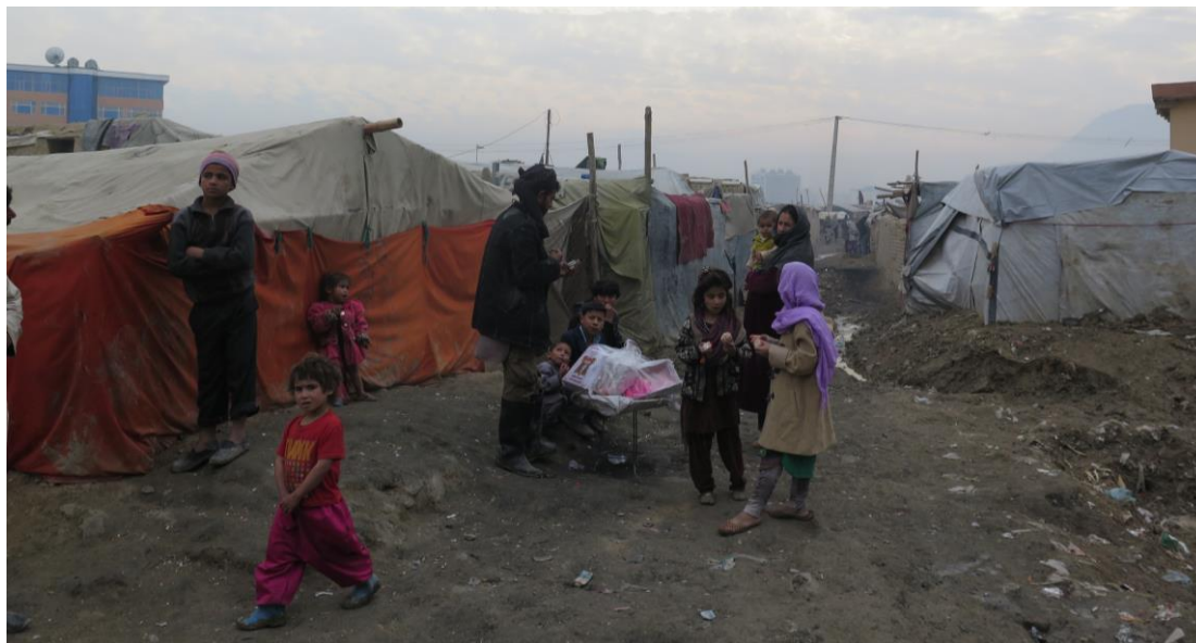
Residents of Chaman-e-Babrak settlement in Kabul, November 2015

The final policy, officially the National Policy on IDPs in Afghanistan, was endorsed at a meeting of the Council of Ministers on 25 November 2013 and launched by the Afghan government on 11 February 2014.