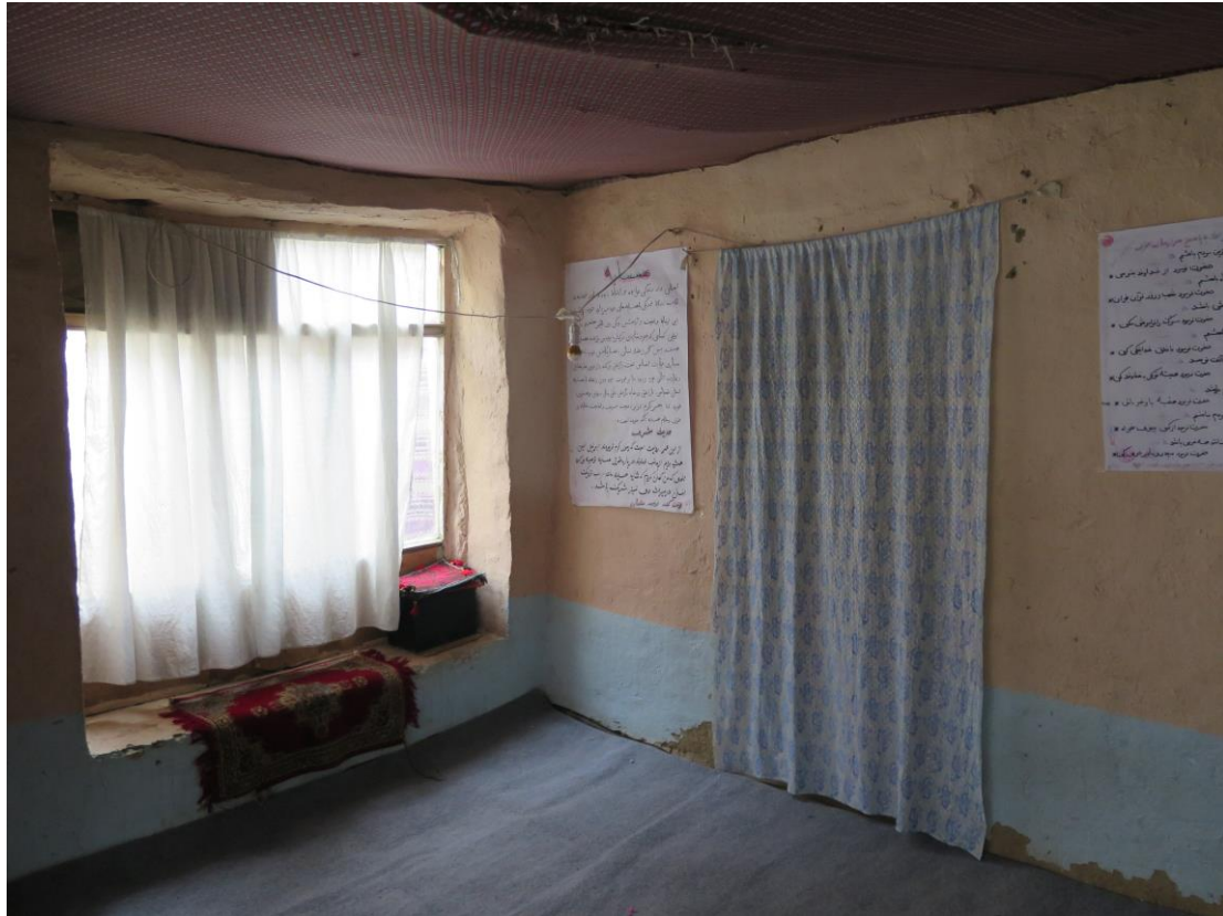
A room used as a classroom for displaced children in Chaman-e-Babrak settlement in Kabul, November 2015

There is also much recent evidence that displaced women and girls find it particularly difficult to access education. A comprehensive 2014 study by the NRC and The Liaison Office found that young displaced women and girls are often forbidden from leaving their homes by male relatives, making attending school—extremely difficult. The isolationism facing women and girls contributed to a sense of desperation and hopelessness, with the study reporting serious mental trauma among interviewees. 218