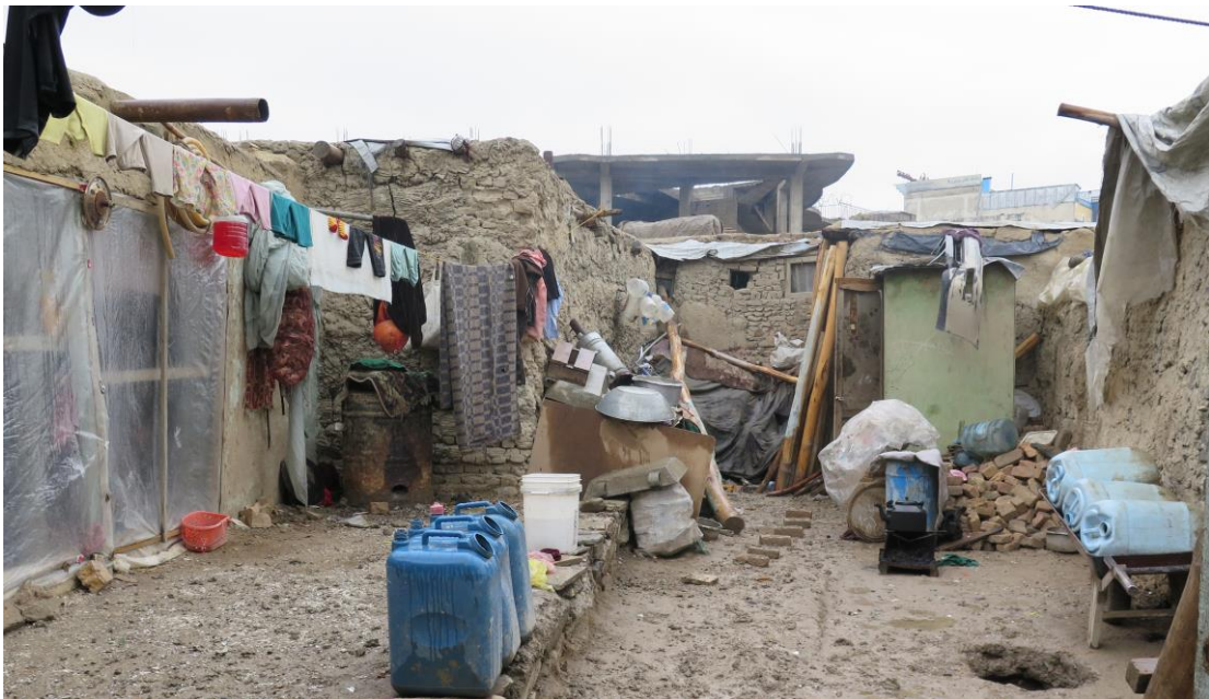
Chaman-e-Babrak settlement, Kabul, November 2015

Past attempts to allocate government land to displaced people or returnees in Afghanistan, as stipulated in Presidential Decree 104 (December 2005), have been largely ineffective and riddled with corruption. 131 The land has often been barren or unfit for agriculture and too far away from services and employment opportunities. 132