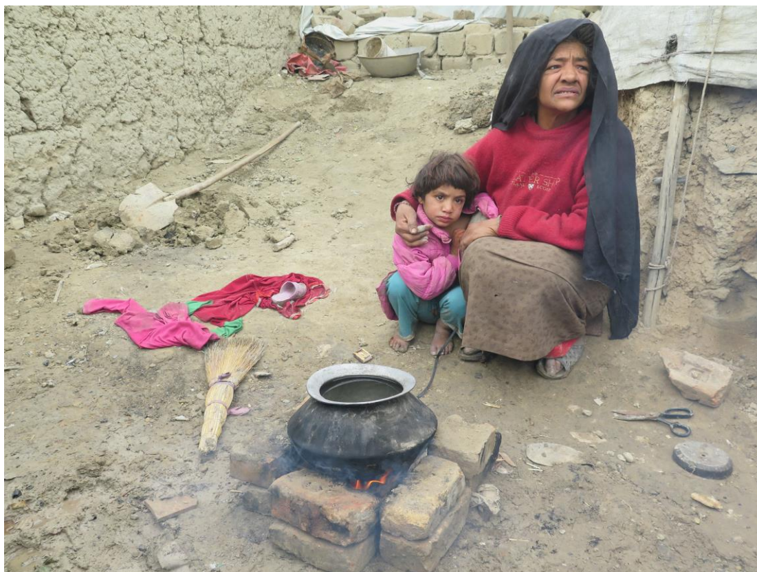
A displaced woman with her daughter in Kabul, November 2015