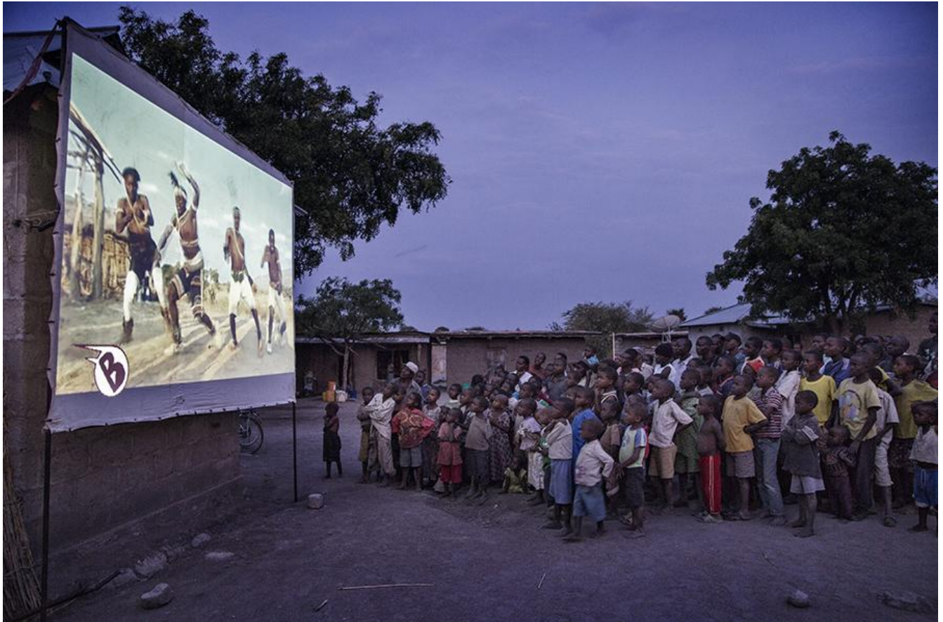
Children watch a video at an outreach event held by Agape AIDS Control Program, a nongovernmental organization working to end child marriage. Shinyanga, Tanzania. August 4, 2014.

For example, in Malawi, various government entities, officially coordinated by the Ministry of Gender, Children and Community Development, are mandated to tackle violence against women, including child marriages. The Ministry of Justice is responsible for the prosecutors, the Ministry of Gender, Children and Community Development for child protection workers, and the Ministry of Interior for the police. However, there is little communication or formal referrals on specific cases among these entities.