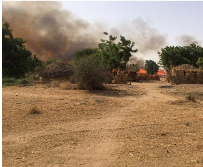
Houses burning following the attack by Boko haram in Bia, 20 April 2015.

The insurgents poured gasoline on the houses and set them on fire. The houses burned rapidly as the majority had roofs made of straw. Abdoullahi Boukar explained: