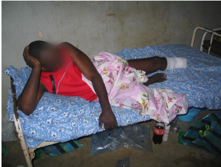
A 43 year-old man had his leg amputated following the suicide attack at the Maroua market, July 2015.

A 32 year-old trader at the central market told Amnesty International that he saw the suicide bomber who was a young girl "dressed like a beggar". 130