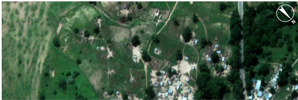
Figure 2. On October 4, imagery shows the southwest area of Doublei.

DigitalGlobe Natural Color Imagery, October 4, 2014, 11.1737°, 14.2442°