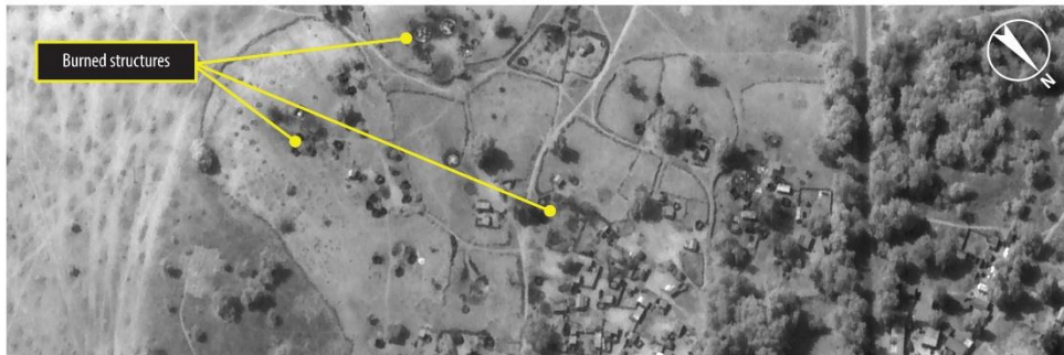
Figure 3. Imagery on December 29 shows many structures in the southwest area have been damaged or destroyed.

DigitalGlobe Panchromatic Imagery, December 29, 2014, 11.1737°, 14.2442°