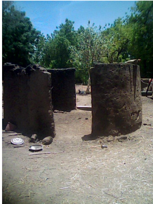
One of the houses destroyed in the village of Doublé, December 2014.

Looting of homes by the security forces was reported and witnesses described how security forces stole money and other goods in front of them, while supposedly searching the premises.