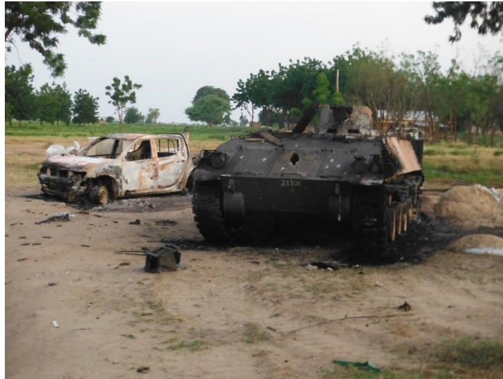
One of the tanks used by Boko Haram to attack Amchide, 15-16 October 2015.

Boko Haram combatants also attempted to drive a car bomb against the military base, but the soldiers managed to destroy it before it exploded. 105