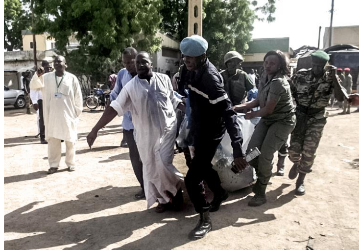
Security forces carry the remains of one of the victim of the blasts in Maroua, 22 July 2015.

"There's a truck-loading station in Barmare, where lorries get ready to travel to other markets of the region or to Chad. There were many people when the bomb exploded. I was having lunch in a small restaurant. I don't know how I was not wounded, I really thank God. After the explosion, there was panic and people were screaming. I saw at least 5 dead bodies. I helped those wounded and tried to comfort them." 133