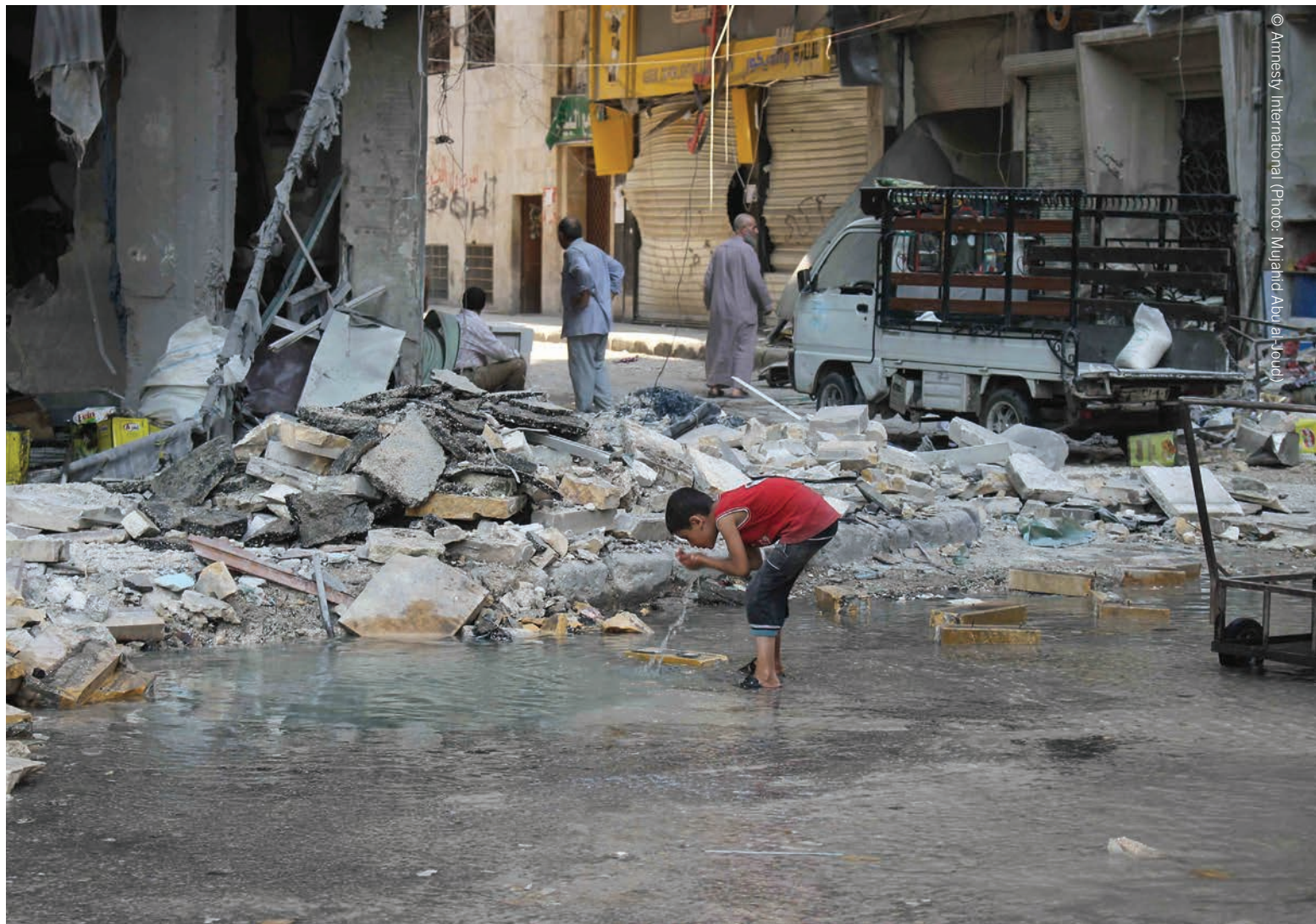
© Amnesty International (Photo: Mijahid Abu al-Joud)