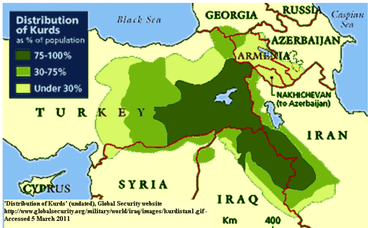
Map: Distribution of Kurds – Ctrl Click to enlarge 15

The US Department of State reported in April 2011 that “Kurds who publicly or politically asserted their Kurdish identity or promoted using Kurdish in the public domain risked censure, harassment, or prosecution”. The same report describes various restrictions on the public use of Kurdish dialects, and documents a number of prosecutions of Kurdish politicians for speaking in various forms of Kurdish in the parliament during 2010. 16