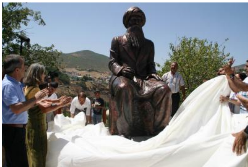
Unveiling of Seyid Riza statue 36

Council in the summer of 2010. 34 A second source, dated 29 July 2010, reported on the opening of the Seyid Riza statue, suggesting that the unveiling took place in late July 2010. 35