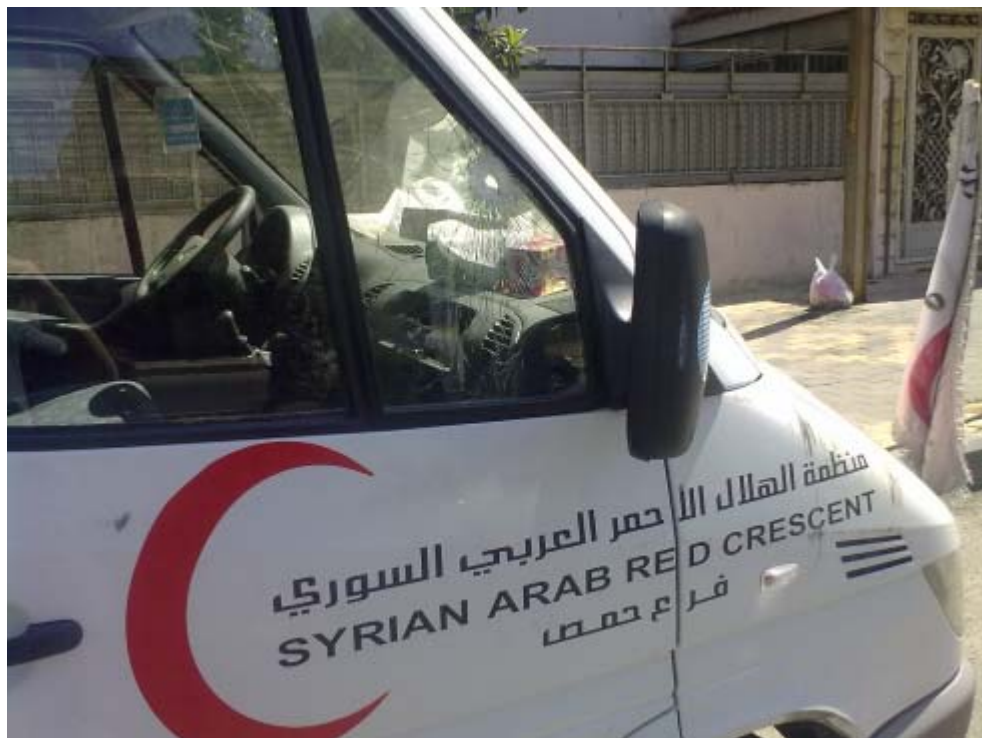
The Syrian Arab Red Crescent ambulance that was hit by at least 12 bullets on 7 September 2011.

"After the battery was charged, he spoke again with his commanders, and returned. He gave us back our cell phones and allowed us to leave. We returned to our office after around an hour."