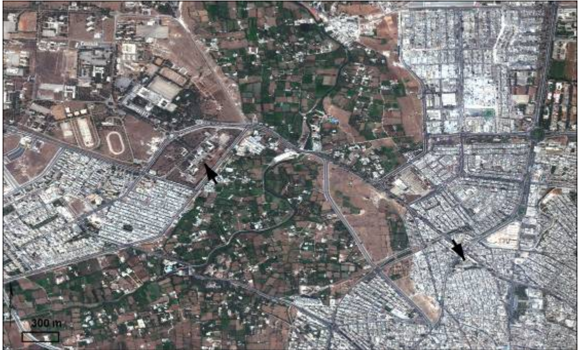
Homs: wounded people have no safe place to go. (Lat 34.711561 Long 36.707211).

In Tell Kalakh, a western town that falls under the governorate of Homs, residents opposed to