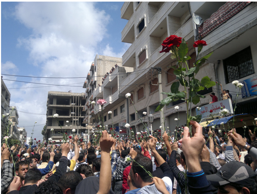
A peaceful pro-reform demonstration in Banias, a coastal town north of Damascus

Since the end of 2010, millions of people across the Middle East and North Africa region have taken to the streets to call for greater rights and freedom and the replacement of authoritarian regimes. In Syria, ruled with an iron hand by Hafez al-Assad from 1971 to 2000 and since then by his son Bashar al-Assad, small demonstrations were held in February but evolved into mass protests only in mid-March. Since then, the protests have spread nationwide on an unprecedented scale and with a momentum that shows no sign of abating despite severe government repression which has seen many hundreds of people killed.